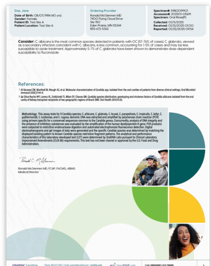
Considerations & Methodology